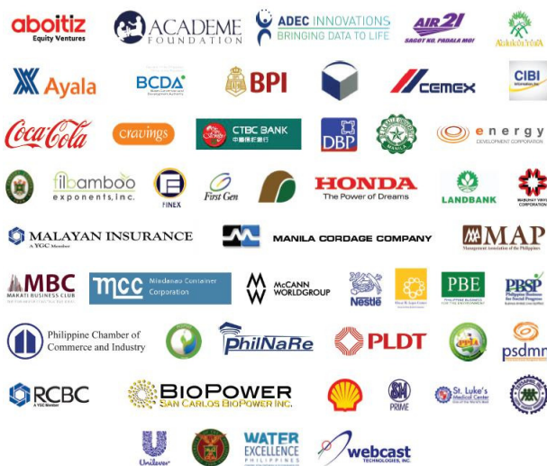
Signatories to the Manila Declaration

See video with Private Sector voices on the Manila Declaration More information