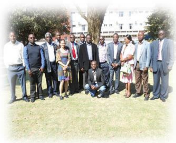
NAMA Net Onsite Training on Scenario Development and Working Group NAMA Concept Review Meeting in Zambia

Following the formal launch of LECB NAMA-Net in New York on 26-28 February, the seven consultant teams have begun activities at the national level. After preliminary work, such as desktop research, data collection, stakeholder consultations, skill and resource mapping, and assessment of NAMAs currently under development, NAMA Net consortium colleagues, in coordination with national LECB teams, have carried out the following activities on-the-ground: