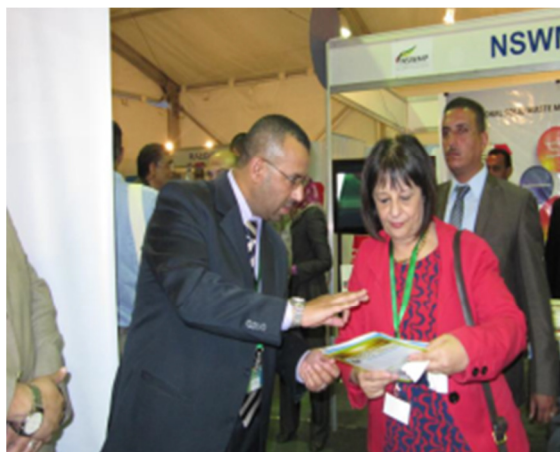
LECB Project Coordinator, Samir Tantawi explains the NAMA Long-List from transport and energy sectors to H.E Dr. Laila Iskander, Minister of Environment

The Ministry of State for Environmental Affairs of Egypt and Egyptian Environmental Affairs Agency (EEAA) recently celebrated the World Environment Day (WED) in El Gouna Resort, Hurghada City, Red-Sea Governorate (about 400 Km East of Egypt), under the auspices of H.E. Dr. Laila Iskandar, Minister of Environment and, and with a sponsorship of Egyptian companies (Citadel, EgyptAir, Abu-Qir Fertilizer Co., National Bank of Egypt).